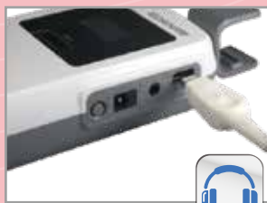
Support Earphone Output