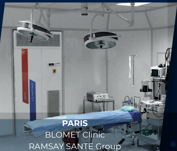
PARIS BLOMET Clinic RAMSAY SANTE Group