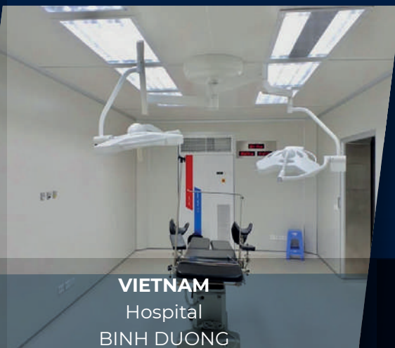
VIETNAM Hospital BINH DUONG

Reduces construction, installation, operation and maintenance costs