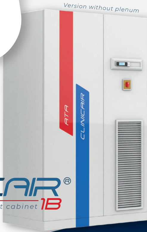
Version without plenum