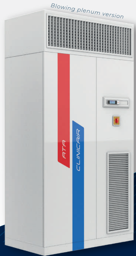
Blowing plenum version

Hygienic Air Handling unit Cabinets CLINICAIR® 1B is a Plug & Play device designed to treat and guarantee air quality conditions in the operating room. It meets all the requirements of Risk 2 to Risk 4 rooms according to NFS 90-351 (April 2013).