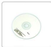
CD (PC software)