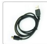
USB data line