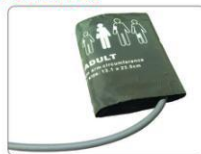
Cuff for adult